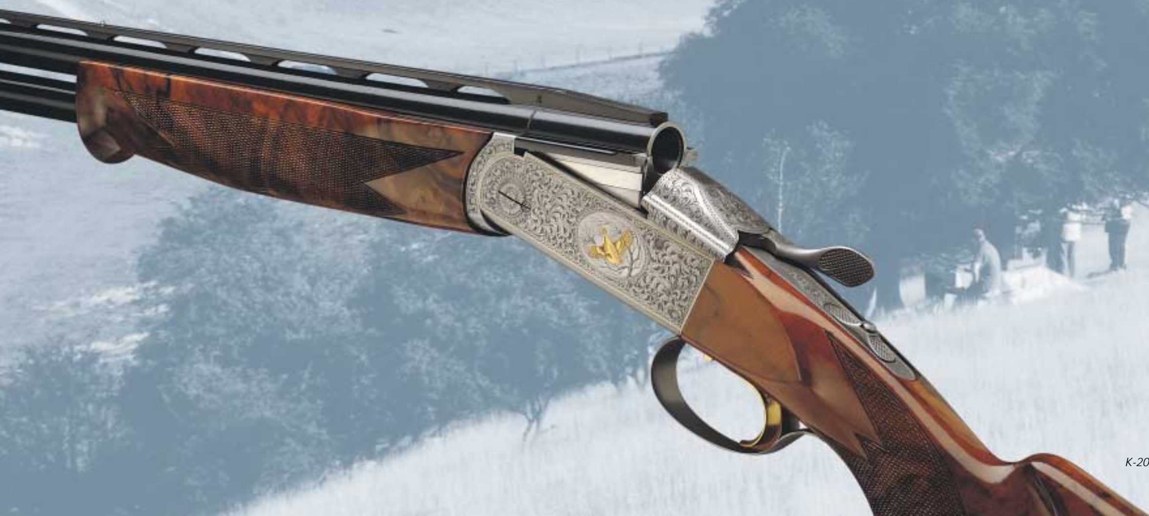
K-20 Gold Plantation Coin

The K-20 is a sporting, skeet, and field shotgun built on an elegantly compact twenty gauge frame. It is endowed with the crisp triggers and overall feel of the K-80 and finished with the handcrafted precision that you expect from a Krieghoff. It is a gun that anyone who appreciates the pleasures of the small gauges will have to have, and it is available with the complete range of engraving patterns shown for the K-80.